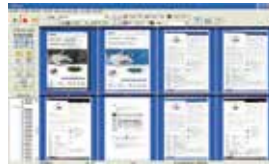
The AVScan X main screen

The Intelligent Document Management Tool