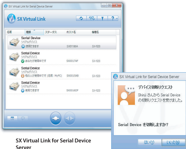
SX Virtual Link for Serial Device Server